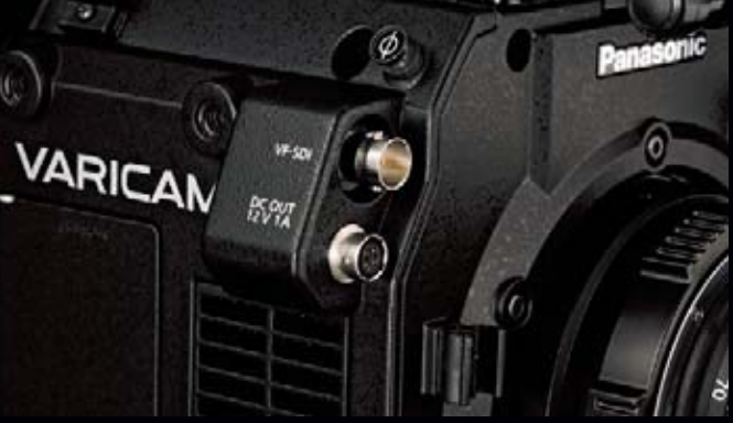
EVF Connections with HD SDI and DC Power