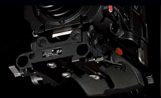
The New Shoulder Mount with a Base Plate.