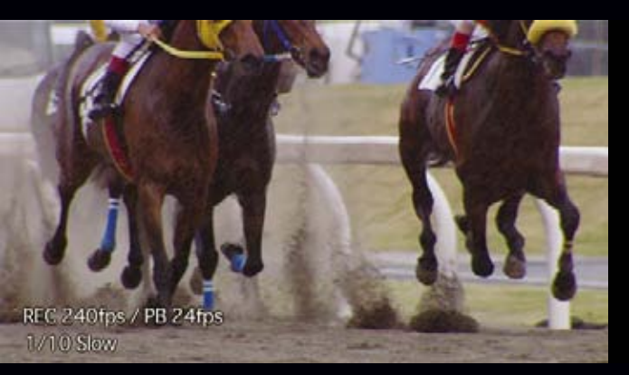
2K/240p Slow Motion