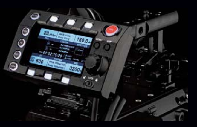
Detachable Control Panel with Monitor