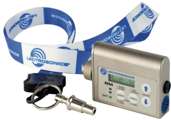
The RM is supplied with a quick-release lanyard

Input gain is adjusted by setting the desired value on the LCD on the RM in the same manner as it is adjusted on the transmitter. A single pushbutton press and a brief tone burst then transfers the setting to the transmitter. Frequency is adjusted in the same manner, with the options of setting it directly by hex switch code or adjusting it by block and frequency in MHz.