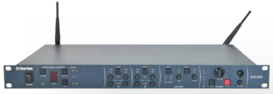
BS410 Base Station

DX410 also features 2-wire and 4-wire bridging and 2-wire auto-nulling. The bridging capability allows the option for combining the 2-wire and 4-wire ports together on either channel A or B, allowing operators to use a 4-wire out to send all the audio to a mixer, matrix intercom or other audio source. 2-wire auto-nulling enables fast and accurate integration with Clear-Com or TW wired partyline systems.