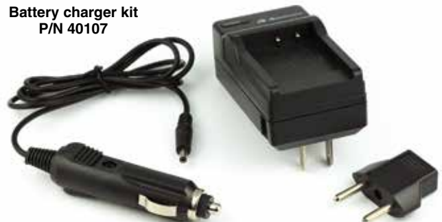
Battery charger kit P/N 40107

CAUTION: Use only Lectrosonics battery chargers, P/N 40107 or CHSIFBRIB.