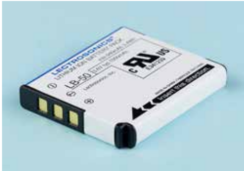
40107 Battery charger kit for Lectrosonics LB-50 battery; includes charger, EU plug adapter and vehicle auxiliary power cord