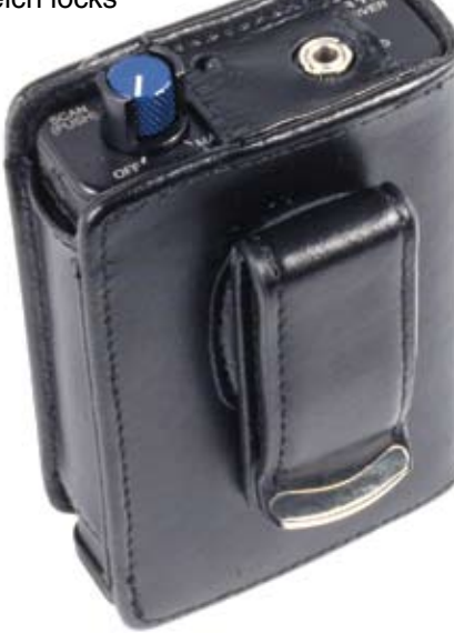
The R1a includes a leather pouch with belt clip to help protect the receiver and provide a way to secure it during use.

The receiver operates on one 9 Volt alkaline or LiPolymer rechargeable battery for up to 8 hours and features a tricolor LED low battery indicator. The voltages are internally regulated for stability.