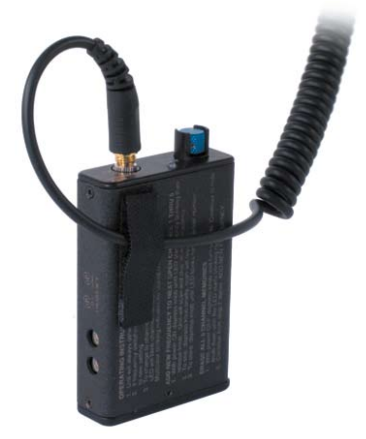
Figure 2 - Headphone cord strain relief