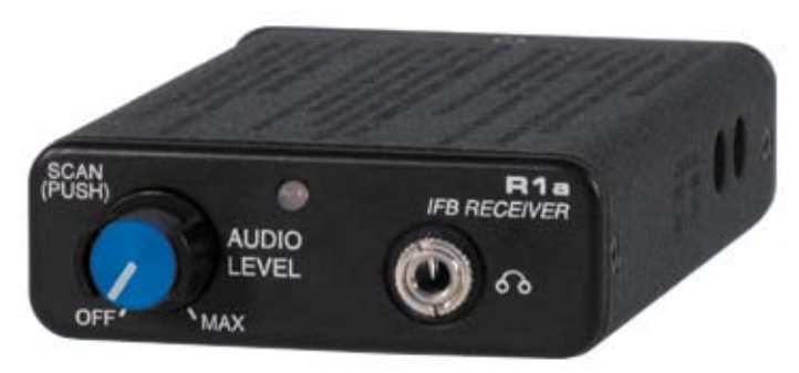
Figure 1 - R1a Control Panel

Refer to the RECEIVER OPERATING INSTRUCTIONS for full details on how to use the single knob control for channel selection, scanning, and programming of the five memory locations.