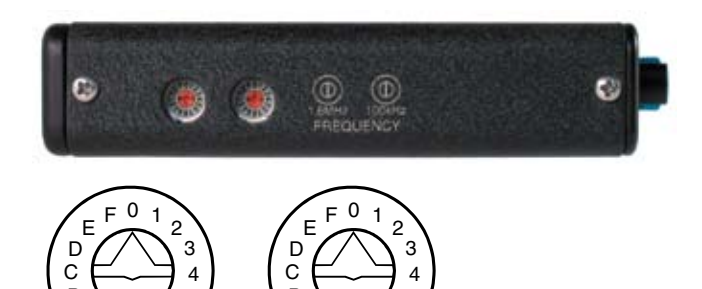
Figure 3 - Frequency Adjustment